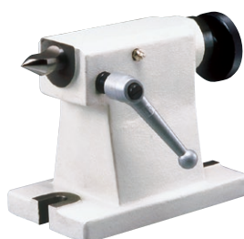
TSA/TSB series Manual type Tail Stock