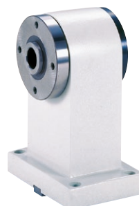
SS series Side Spindle