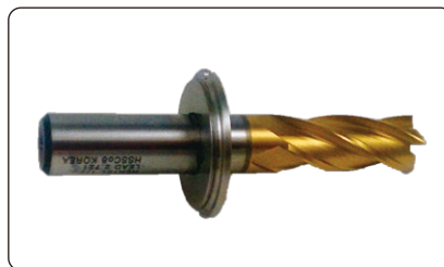
2. Insert a cutting tool into MCC cap.