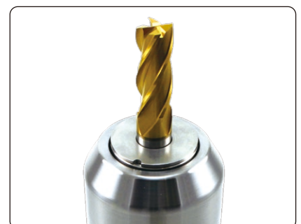
5. Set the ass'y built in 4. into MC milling chuck.