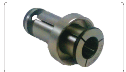
3. Assemble MC collet into MNC nut.